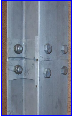
W6X15 FUSE PLATE