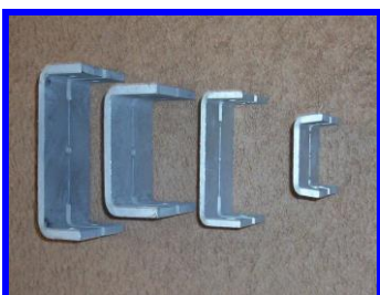
S3x5.7 to W8x18 4" Square Tube